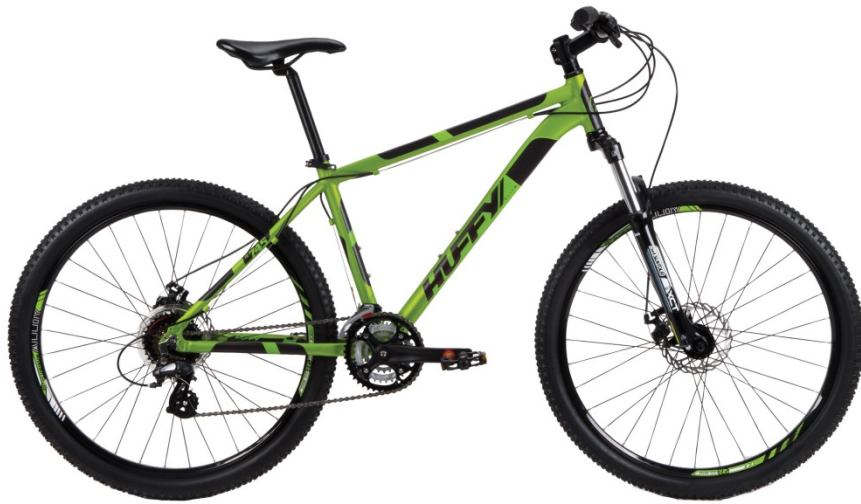
Huffy TR 745 bicycle