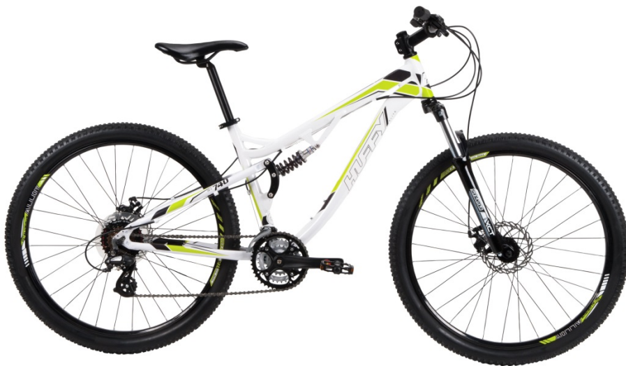
Huffy TR-S 740 bicycle